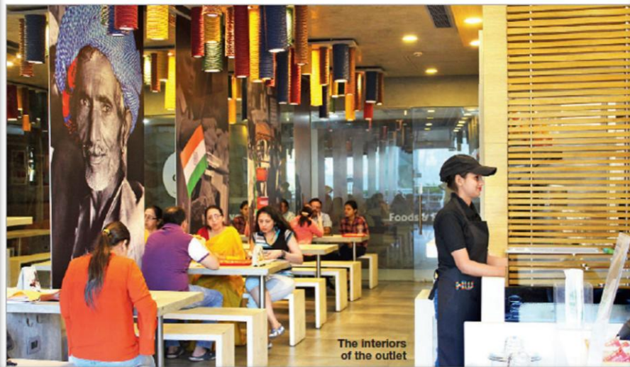
The interiors of the outlet

Address: Nukkadwala, opposite the Hansraj College Hostel entrance, Kamla Nagar Contact: 8527347272