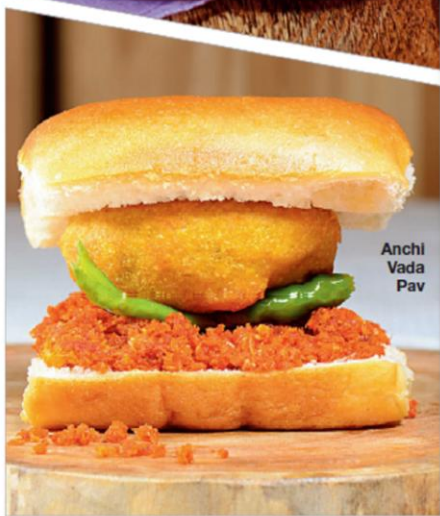
Anchi Vada Pav

N ukkadwala, a QSR (Quick Service Restaurant) chain by the Vatika Group, has started a drive-through service for their restaurants, but with a twist. They call it the Hotspot Delivery and have become the first ones to start such a service in India. This service is for those customers who wish to order on-the-go, which means that if you want to eat something from Nukkadwala but do not have time to dine at their outlet or just want to park and wait in your vehicle for a take-away, then opt for Hotspot Delivery.