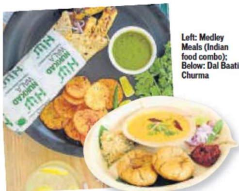
Left: Medley Meals (Indian food combo); Below: Dal Baati Churma

At Nukkadwala, the focus is on authenticity of regional flavours, and quick service