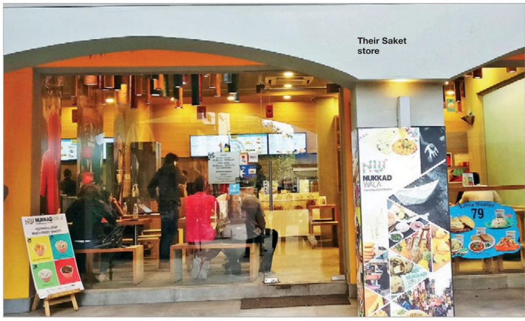
Their Saket store